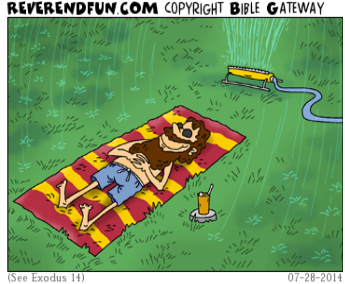
MOSES ENJOYING SUMMER BREAK