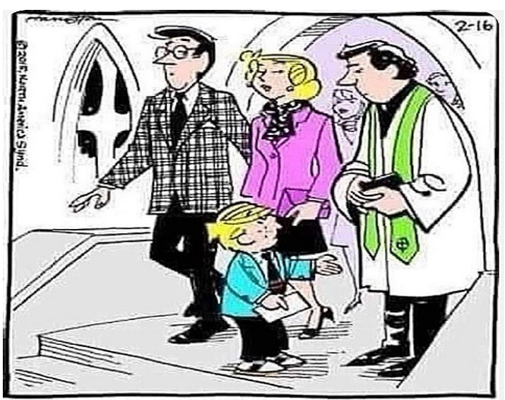
"GREAT SERMON, PASTOR. MY DAD SAID 'HALLELUJAH' WHEN IT WAS OVER!"

SERVING JUNIATA, MIFFLIN & CENTRE COUNTIES www.InHomeServicesOfCentralPA.com Corporate Office 717.363.4913 • 814.321.2145