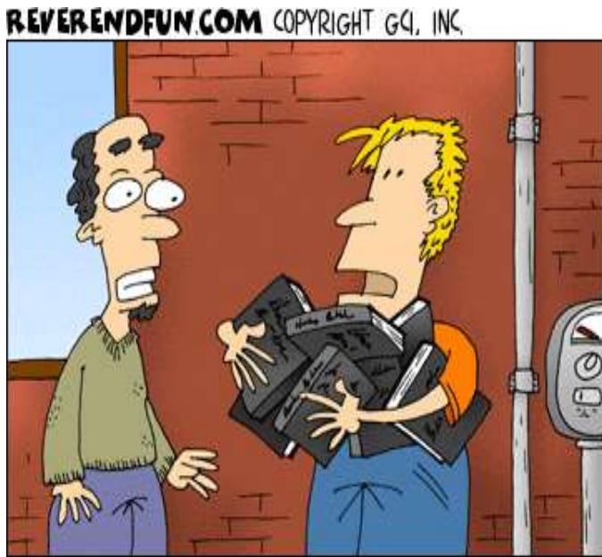
GOOD THING I FOUND YOU GIDEON ... IT SEEMS SOMEONE HAS BEEN HIDING ALL YOUR BIBLES IN HOTEL ROOMS