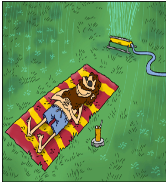
(See Exodus 14)

https://rlcnn.org/category/the-good-news-blast/ , Resurrection Lutheran Church, Newport News, VA, June 27, 2021