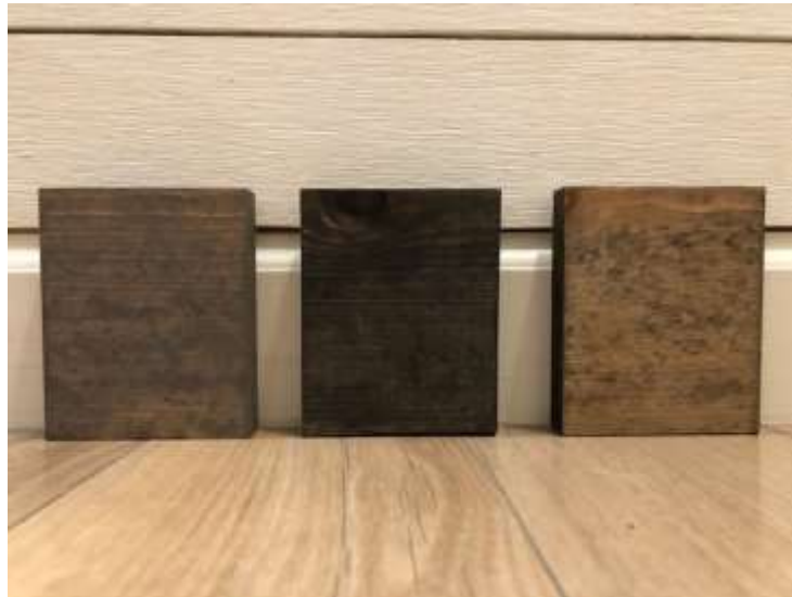
GRAY WALNUT (left)